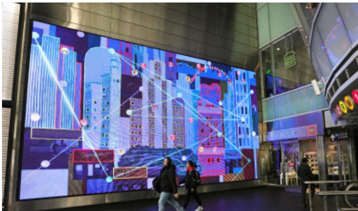
Ezra Wube, Fulton Flow , 2019, digital animation, Fulton Center