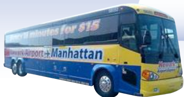
Newark Airport Express

CONNECTION: Take Metro-North Hudson, Harlem, or New Haven Line trains to Grand Central Terminal for an easy connection to the Newark Airport Express bus service (operated by Olympia Trails/Coach USA, a Stagecoach Group subsidiary)