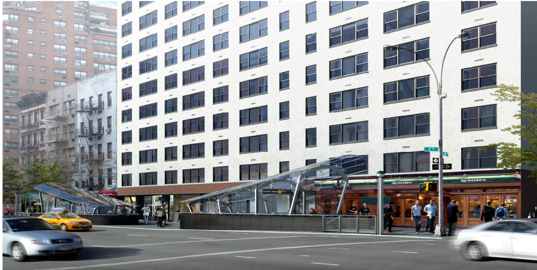
72nd Street Station - Entrance 1 at 69th Street and Second Avenue.

The follow-on contractor will complete the mezzanine, platform, ancillary structures, station entrances, and the mechanical, electrical, and plumbing systems for the station. The estimated completion date of this contract is Fall of 2016.