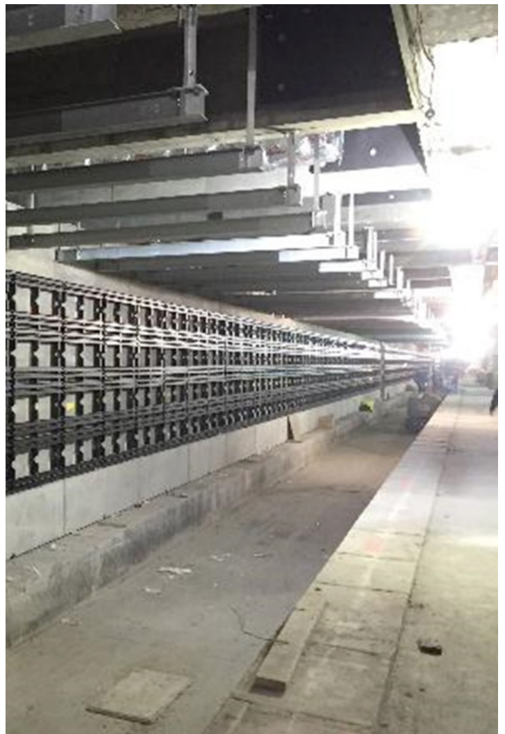
72nd Street Station Main Cavern (platform level) installation of track wall supports