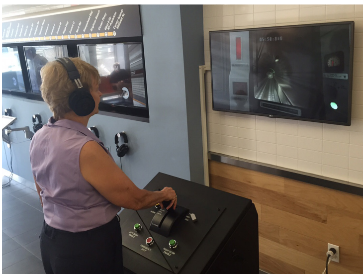
Community residents are invited to compete in the new train simulator tournament during the months of August and September.