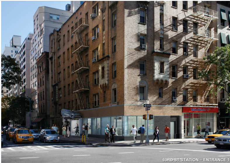
Future station entrance at 63rd Street and Third Avenue.

The new 63rd Street/Lexington Av Station is a renovation of the existing F line station constructed in the 1970s. When renovation is complete, riders will be able to transfer between the Q and F . The remodeled station will have four new entrances at the intersection of 63rd Street and Third Avenue. Entrance 1 will provide two new street-level escalators, Entrances 3 and 4 will provide new staircases, and Entrance 2 will have a street-level ADA accessible elevator. The station will also have four new elevators from the mezzanine to platform levels.